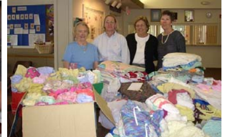
Episcopal Church Women, Church of the Annunciation major contributors to our Project Moses and safe Sleeping Campaign